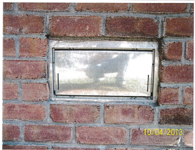
Vent View – Date of Photograph: (See Photo Stamp)